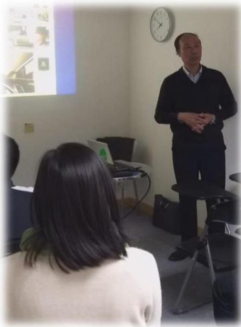
Ir TAM was presenting in the talk