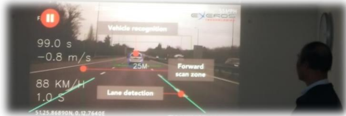
Application of ADAS technology on-board