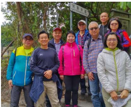
Set off in Tsuen Wan

The trekking team finished the exploration in 4 hours and arrived in Sham Tseng via Tsing Fai Tong New Village, the intermediate exit of the trail. Enjoyed the renowned roasted goose was of course the memorable dessert of the activity.