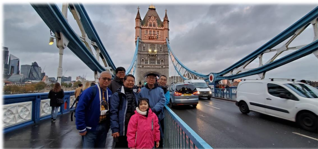
今次旅程還有參觀一些著名景點 - Tower Bridge，加添份快樂回憶。