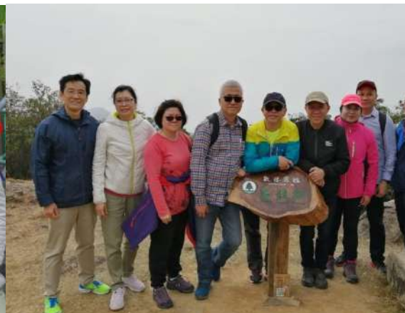
Highest point of the trail, Shek Lung Kung