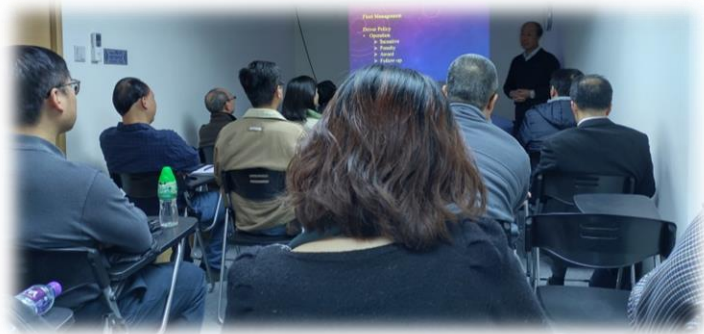
Participants concentrated to the sharing