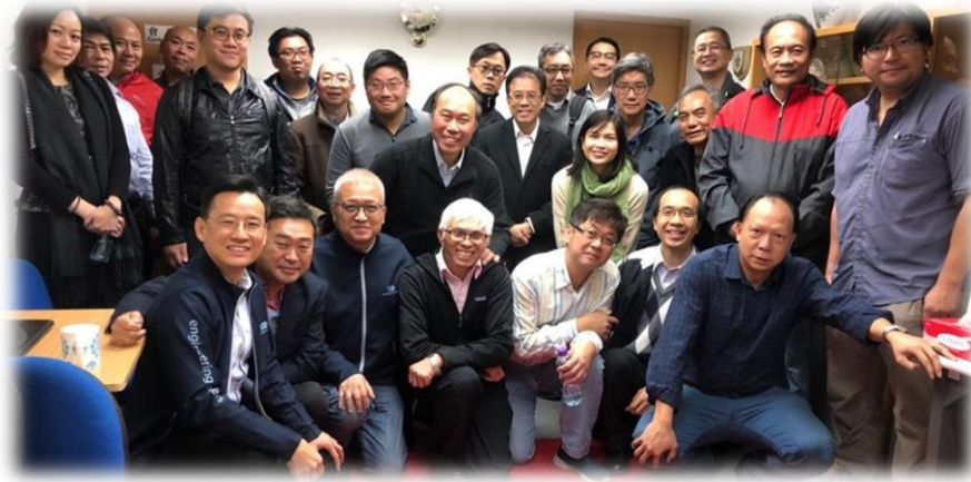
Ir TAM took photo with some of the participants after presentation